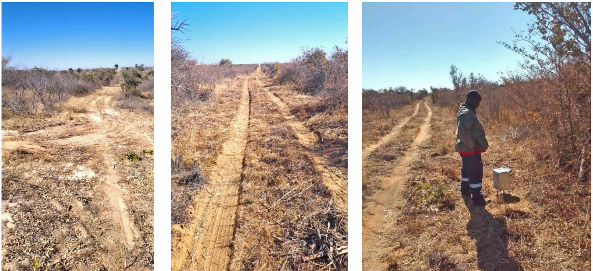
Figure 1. Cleared tracks ready for the mobilisation of the rig