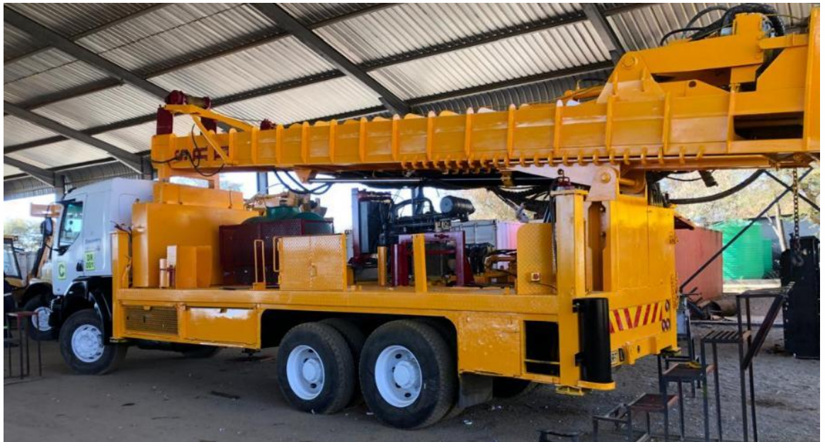
Figure 2. The Super Rock 5000 in final preparation before the commencement of the drilling program later this month.

This announcement has been authorised for release by the Board of Belarox.