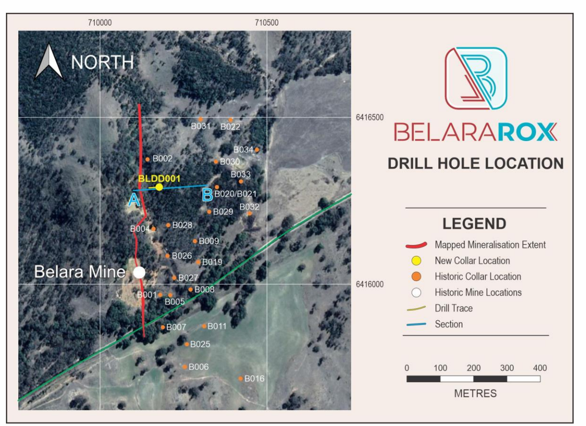
Figure 4. Drill collar location plan of drill collars at the Belara mine compared to interpreted massive sulphide mineralisation.

The Phase One diamond metallurgy drilling started on Thursday 17 March, with the first hole BLDD001 completed to 149.5m down hole (Figure 4; Table 1). The diamond drill rig has moved to the second metallurgy hole BLDD002, with 11m drilled to date. This hole has been abandoned due to the rods jamming and a new hole started (BLD002A) in a similar location.