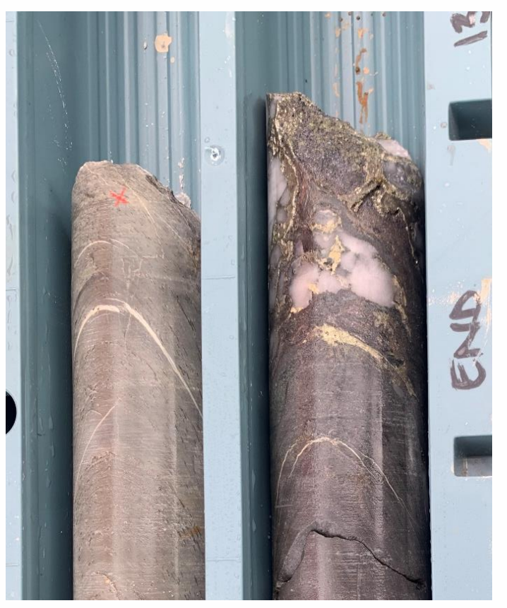
Figure 2. Copper rich massive sulphide mineralisation at 132.0m.