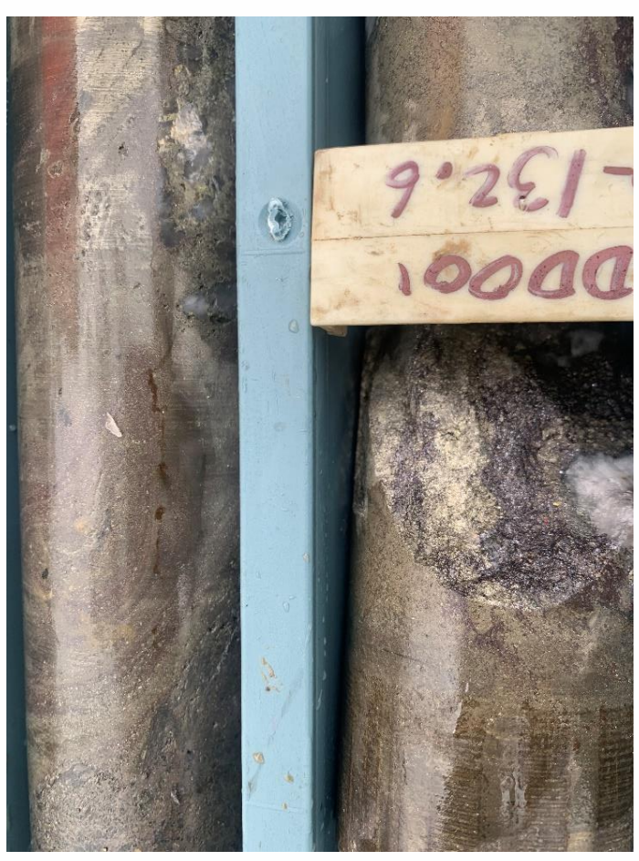
Figure 1. Zinc rich massive sulphide mineralisation at 132.6m.