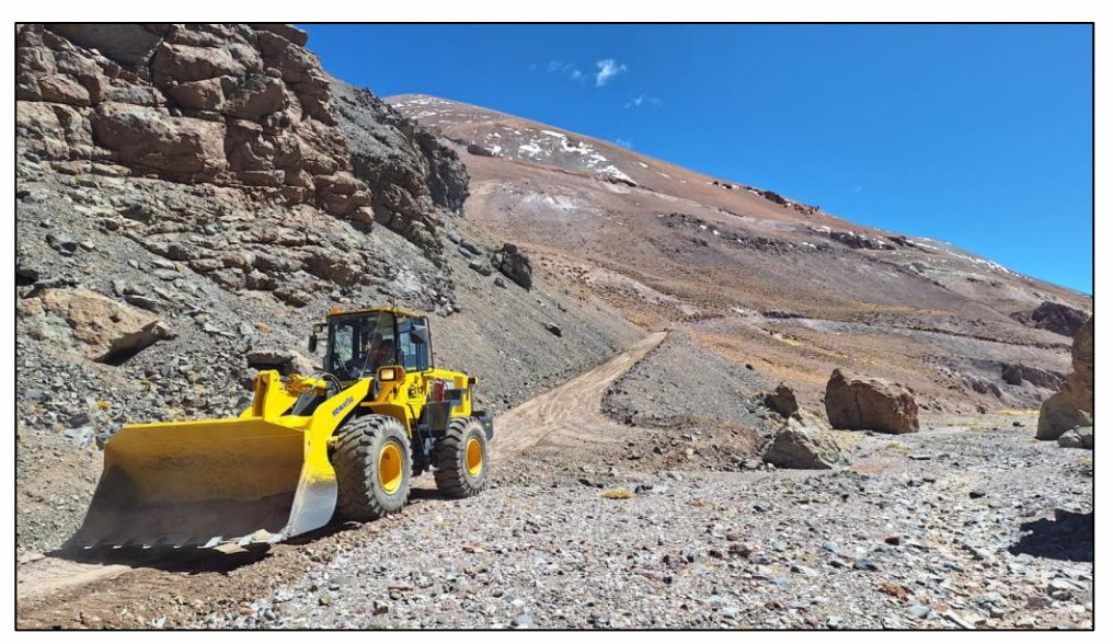
Figure 6: Earthworks machinery at the TMT Project