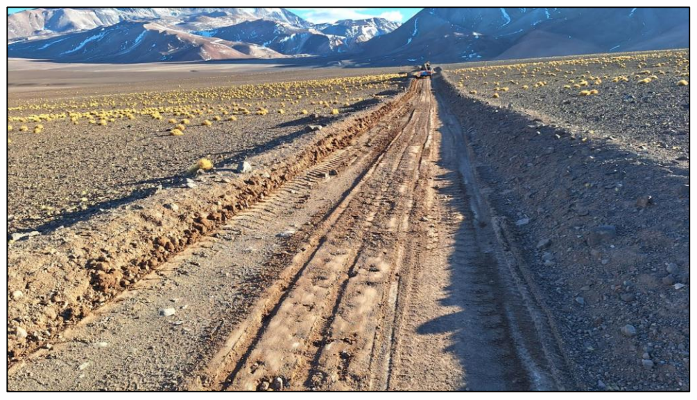
Figure 5: Earthworks machinery in distance repairing the TMT Project's Main Access Track