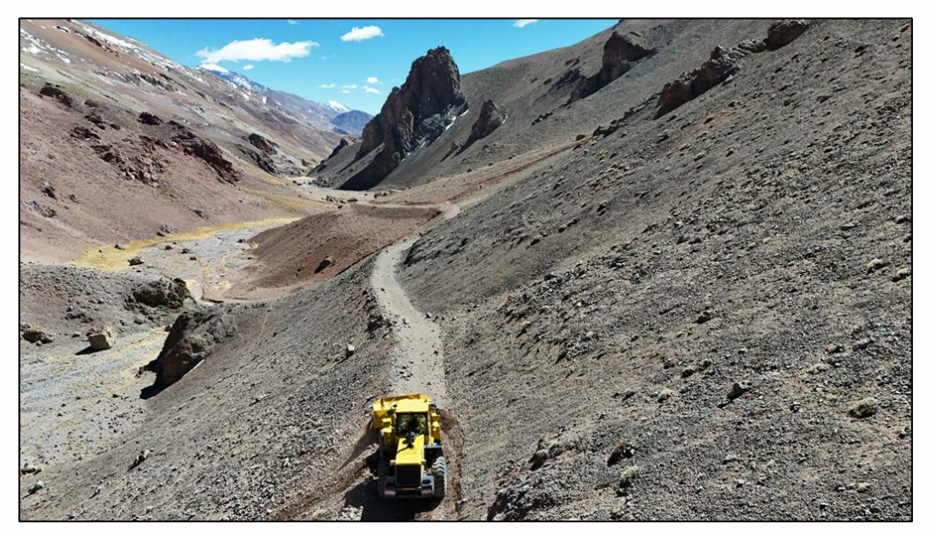
Figure 7: Drone shot capturing the restoration of the access track, track condition is prior to the first pass light vehicle upgrade works.