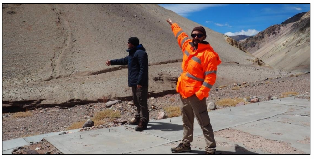
Figure 2: Assessing the conditions of the existing infrastructure, which is ready to be rapidly refurbished.